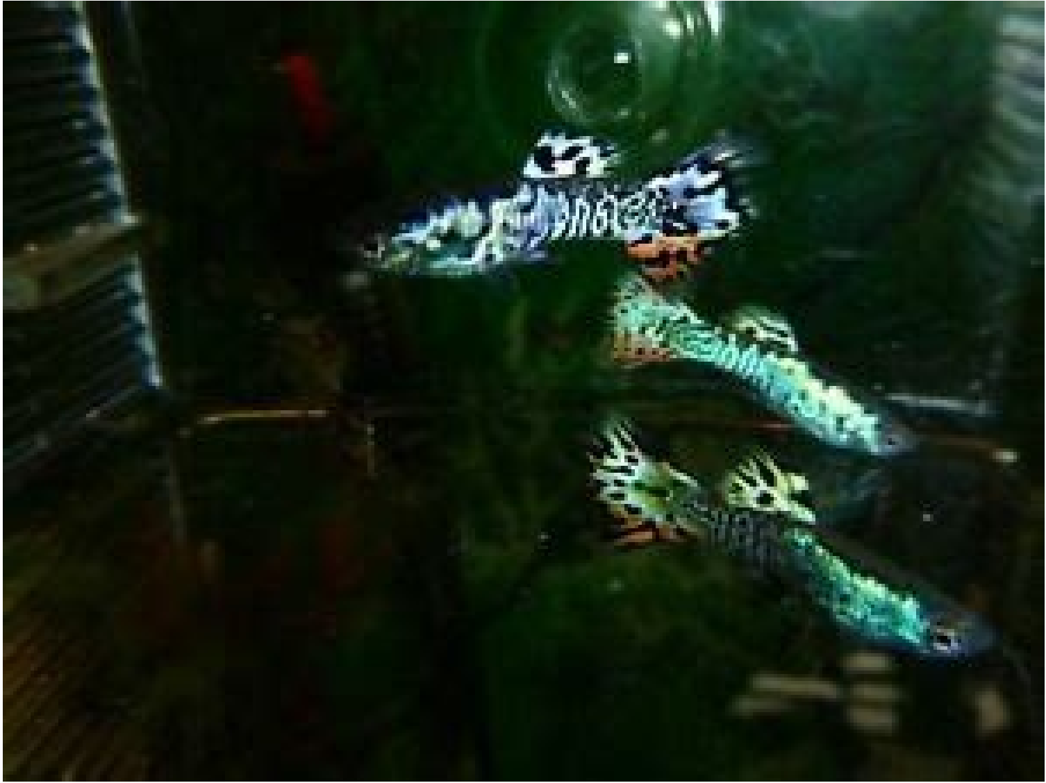
Guppy space requirements. How to introduce guppies to a new tank. 10 gallon guppy tank set up. Neon guppy price. Nebula steel metallic guppy. Nebula steel guppy for sale.